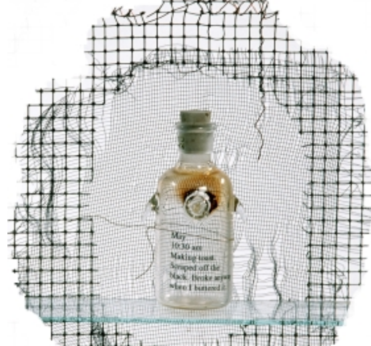
May 10:30 am. Making toast. Scraped off the black. Broke anyway when I buttered it.