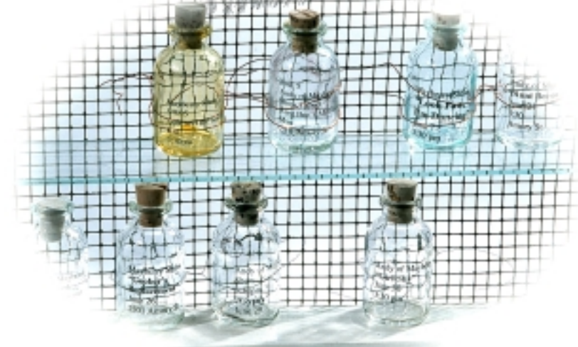
Andy of Mayberry Reruns 5/9/95 to 6/30/95

• Opie and the Spoiled Kid • Aunt Bee's Medicine Man • • Look, Paw, I'm Dancing • Aunt Bee on TV • A Date for Gomer • • Goober's Replacement • Gypsy • Girl Shy •